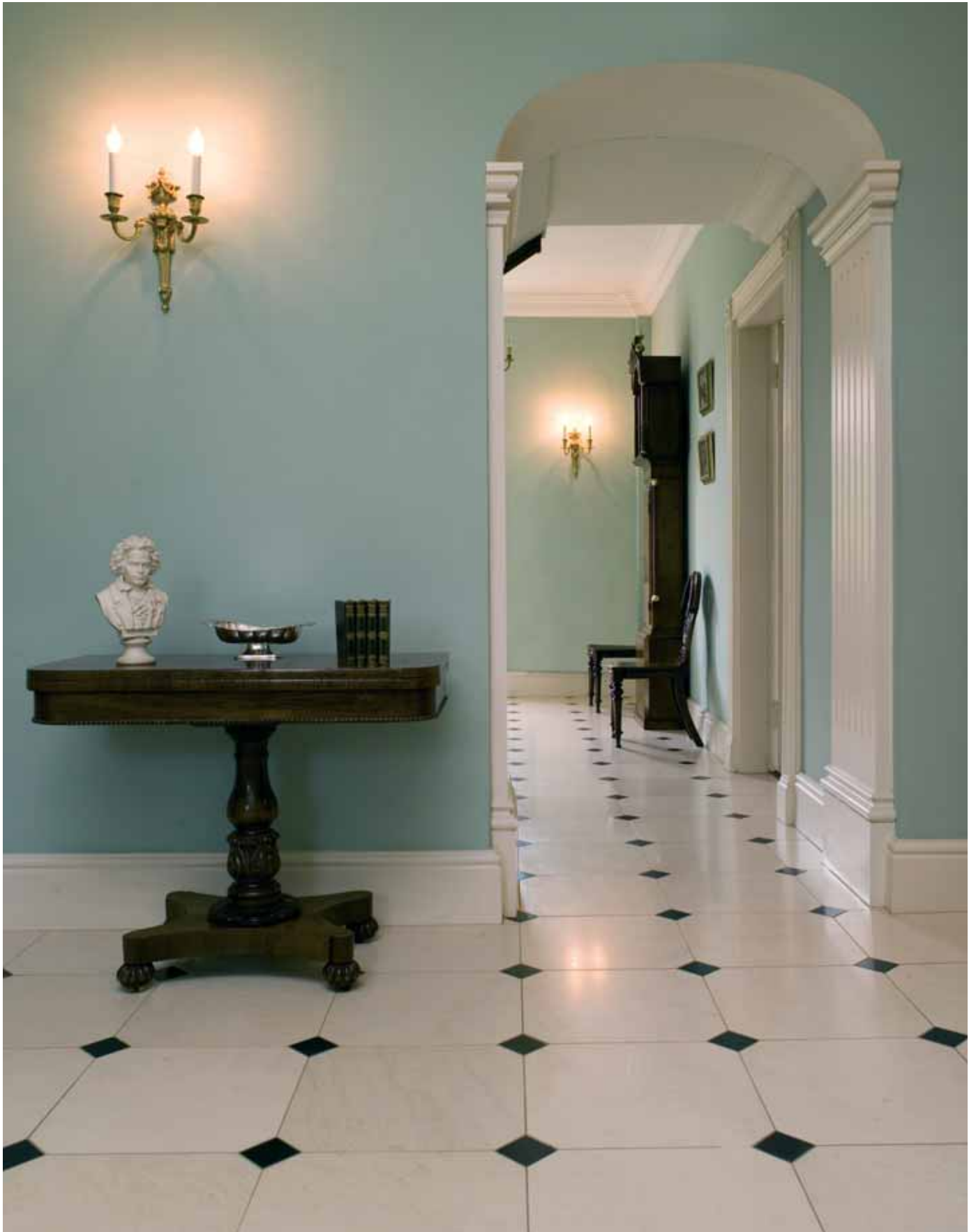
▲ St Etienne is an elegant pale limestone with a subtle oatmeal fleck. The option of a slate inset adds interest and a sense of opulence; ideal for traditional hallways and living areas.